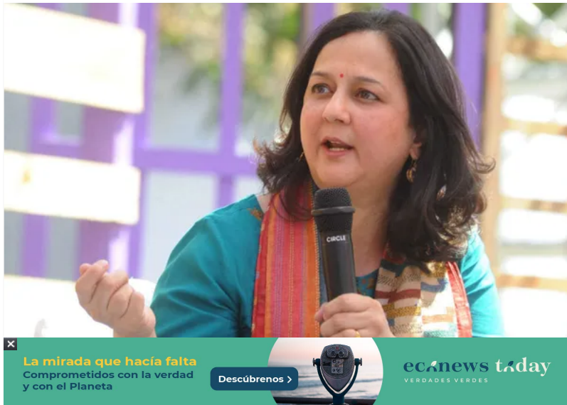
Rohini Nilekani

Author and philanthropist Rohini Nilekani made a strong case for online classes and virtual learning in an exclusive interview to ET NOW. She said a total could end up increasing the digital divide.