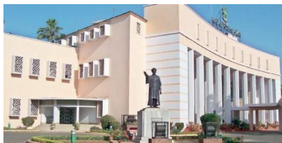
Government assures crop loss aid after getting Centre's premium share