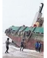
14 crew of Covid posi