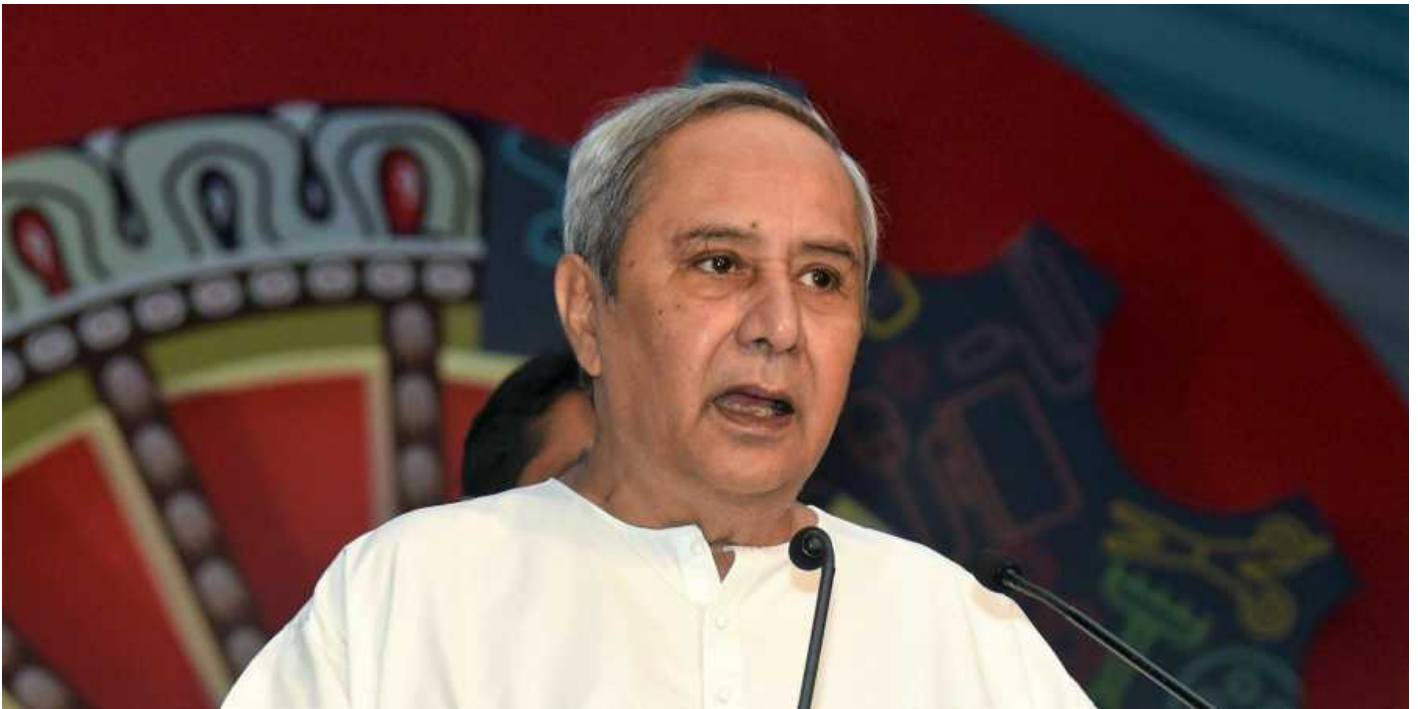
Odisha CM Naveen Patnaik