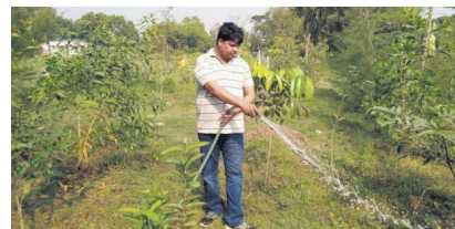
Forest man seeks PM Narendra Modi help to stop green cover loss